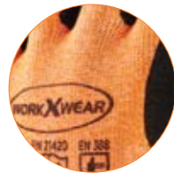
Cut protection Level 3 (EN388)