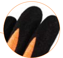
Touchscreen capability using conductive elements