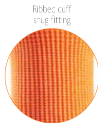
Ribbed cuff snug fitting